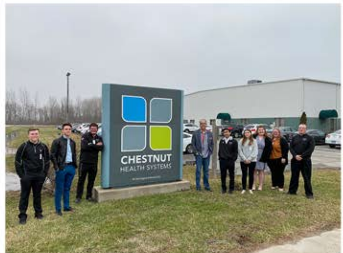
Chestnut Health Systems