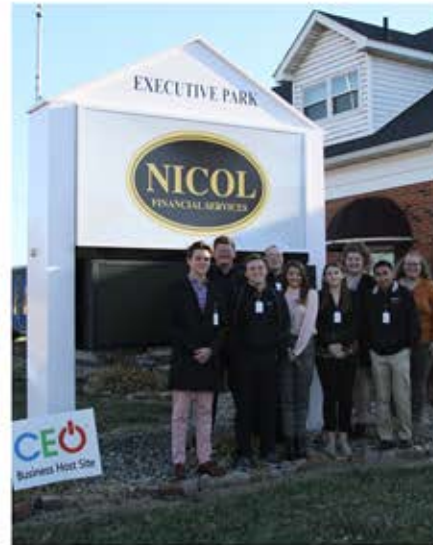
Nicol Financial Services