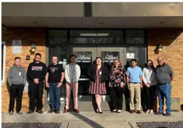
Illinois Electric Works