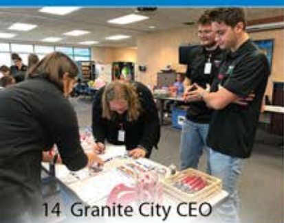
14 Granite City CEO