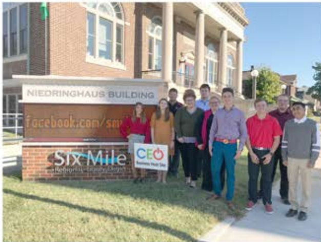
Six Mile Regional Library