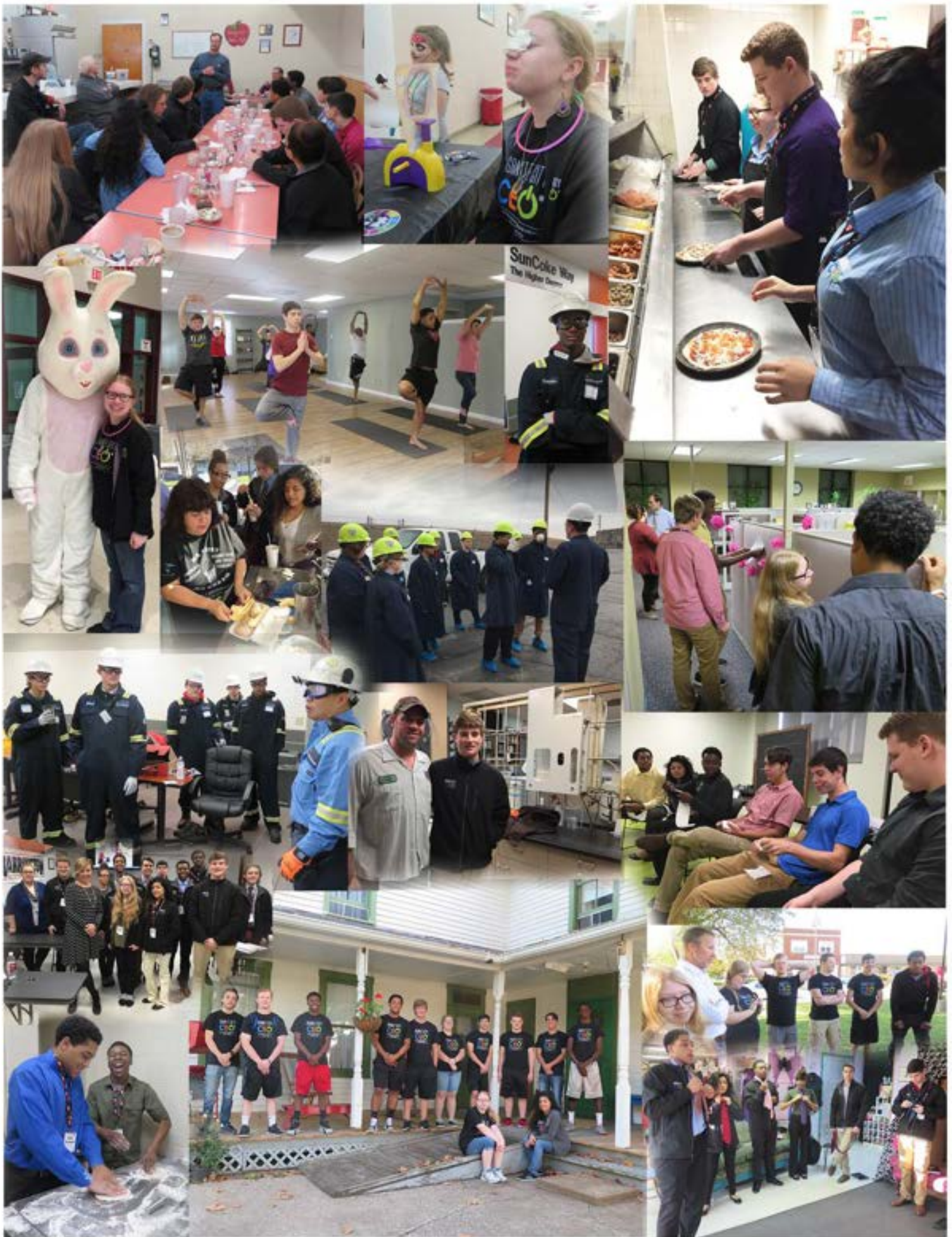
16 Granite City CEO